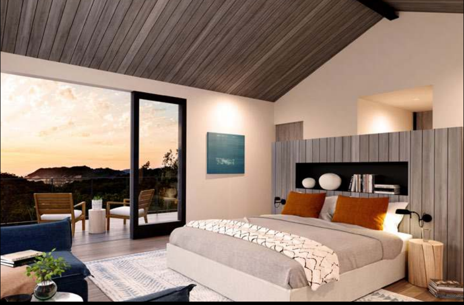
The primary bedroom suite features vaulted ceilings and a private terrace.