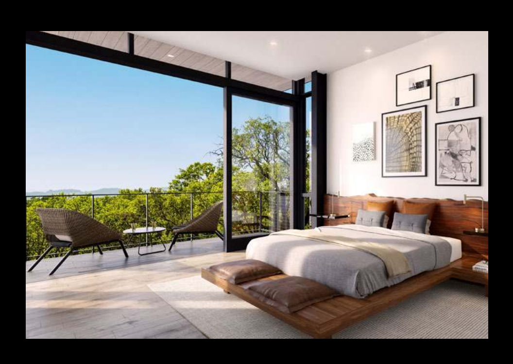
The primary bedroom suite on the upper level opens to a quiet outdoor terrace.