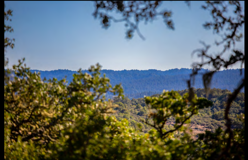
Harvest Homesite 2 enjoys south-facing views encompassing Dry Creek Valley's ridges and acres of distant wooded hills.