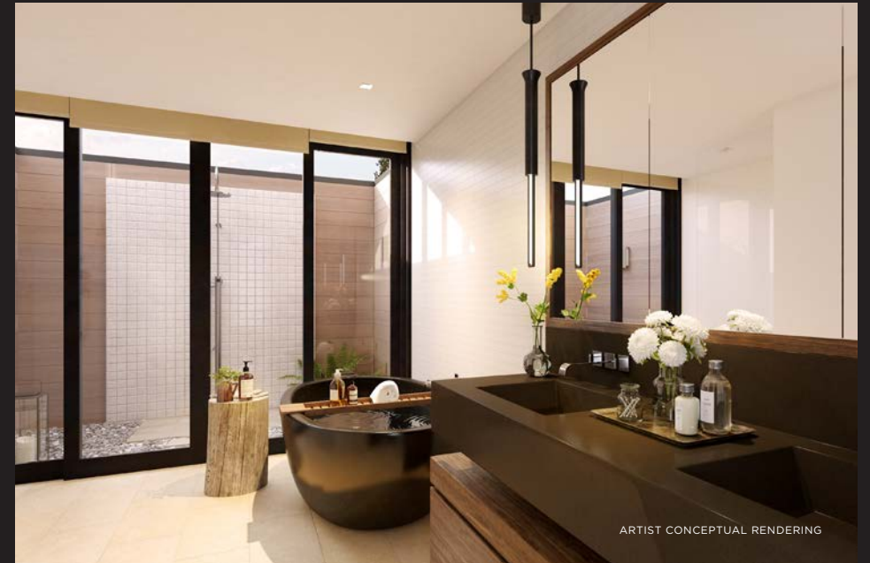
ARTIST CONCEPTUAL RENDERING

The Harvest Home's primary suite boasts a large private terrace plus a soaking tub and an outdoor shower.