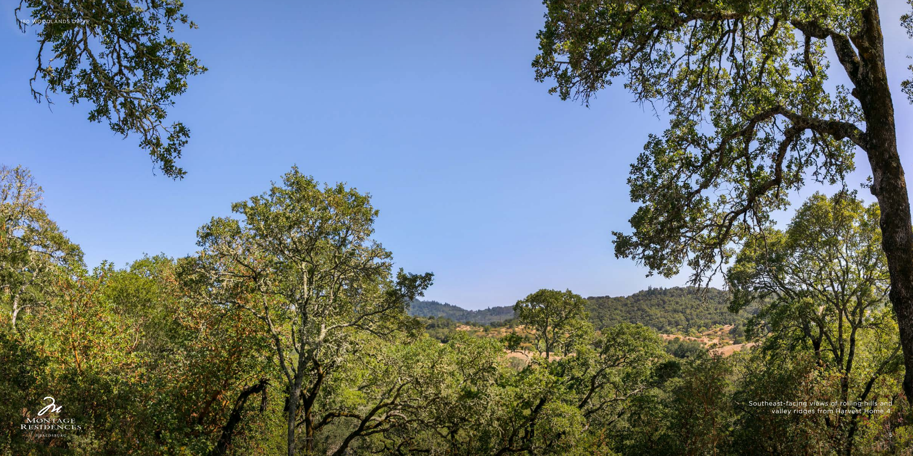
Southeast-facing views of rolling hills and valley ridges from Harvest Home 4.