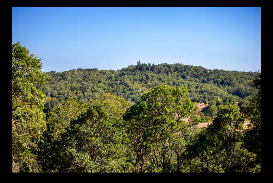
Picturesque southeast-facing vistas from Harvest Homesite 5 capture rolling hillsides and the distant tree-covered ridges of the Russian River Valley.