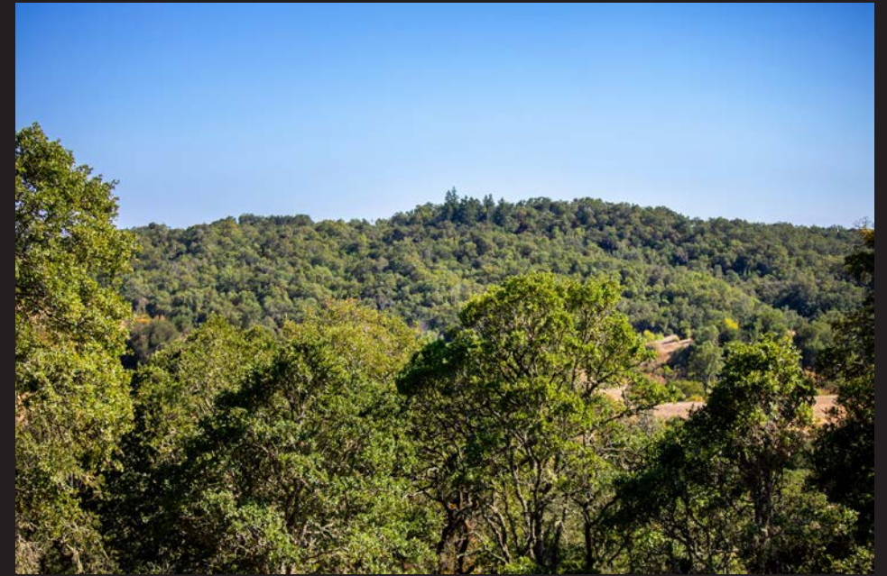
Picturesque southeast-facing vistas from Harvest Home 5 capture rolling hillsides and the distant tree-covered ridges of the Russian River Valley.