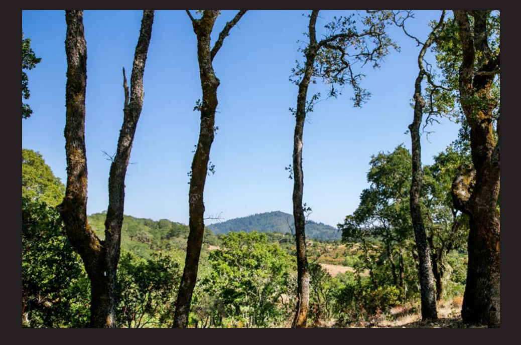
From its private, oak tree-shaded setting, Harvest Home 6 offers southeast-facing vistas of grassy hillsides and the distant ridges of the Russian River Valley.