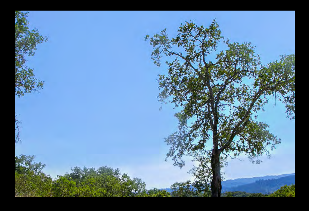
From its elevated position within the community, Estate Homesite 19 offers southwest-facing views that sweep across carefully preserved woodlands and glimpse the forested silhouette of Dry Creek Valley beyond.