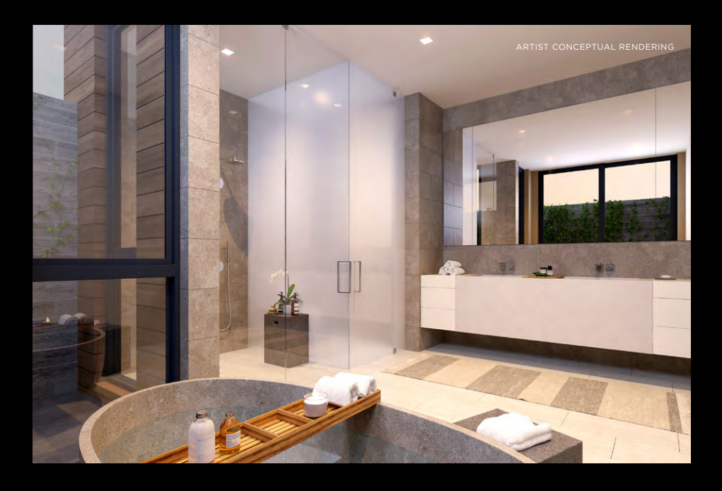
The primary suite is replete with a soaking tub and private outdoor shower.