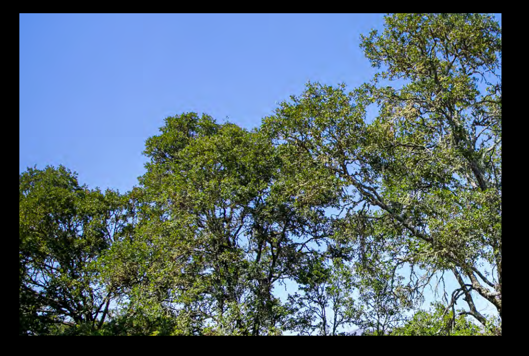
Set amidst carefully preserved native oaks, Estate Homesite 13 offers north-facing views that encompass nearby woodlands and the distant ridges of the Mayacamas.